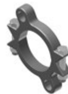
FIGURE 1 (2) GRIP RING w/ BOLTS & NUTS

Step 3: Insert the threaded rods (D) provided and snug the retaining nuts against the restrainer ears (against the flat surface). Do not over-tighten retaining nuts, approximately one turn with a wrench.