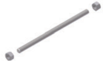
FIGURE 2 (4) T-BOLT & NUT